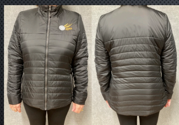
Puffer Jacket $75