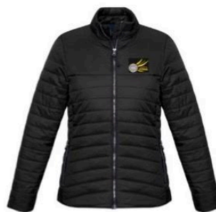
J750L - Ladies