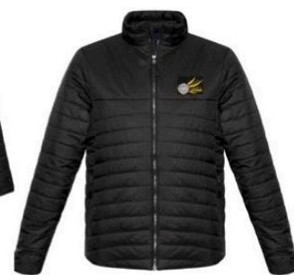
J750M - Men's