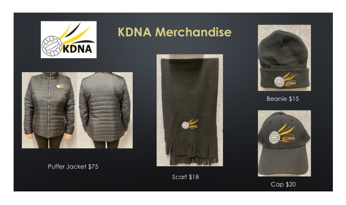
KDNA Black Puffer Jacket Order Form

Puffer Jackets $75, Scarves $18, Beanies $15 & Caps $20